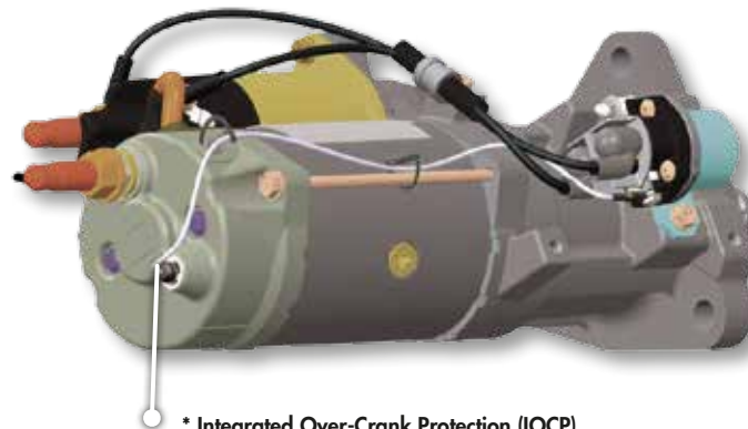
* Integrated Over-Crank Protection (IOCP)